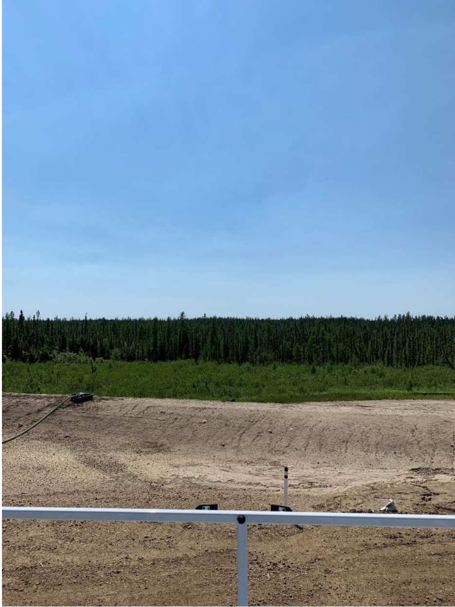
Figure 6 – Environment looking South