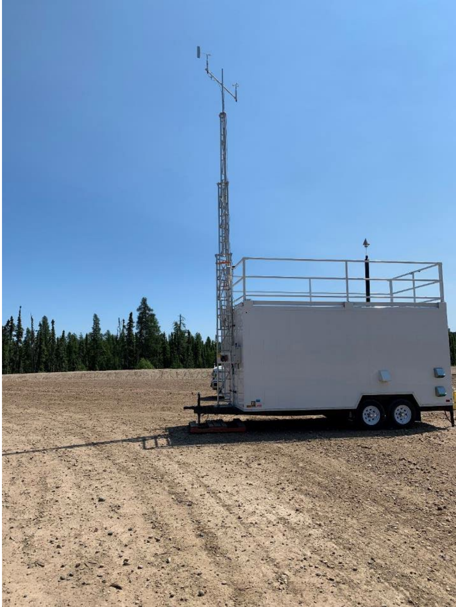
Figure 10 – Curb shot of the monitoring station