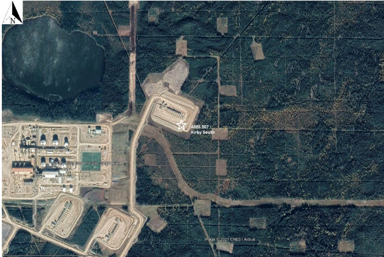
Figure 2 – Aerial photo showing AMS 507