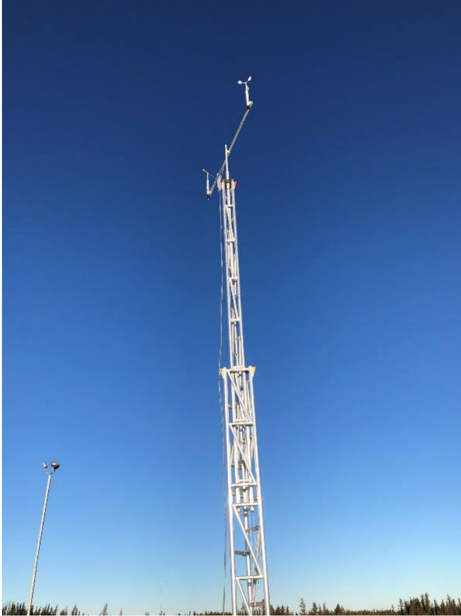
Figure 8 – Meteorological Tower