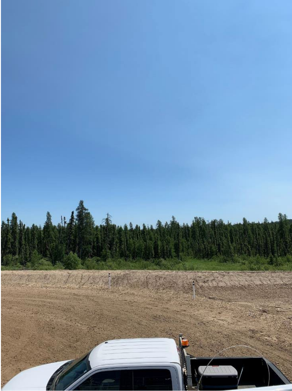
Figure 5 – Environment looking East