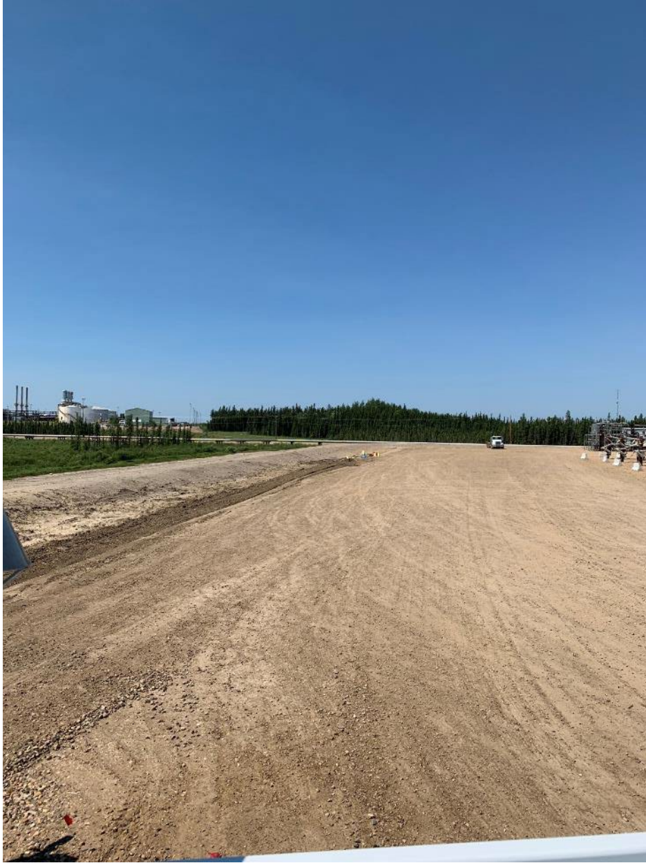
Figure 7 – Environment looking West