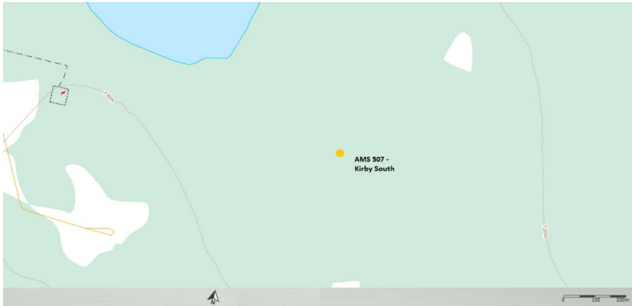
Figure 1 – Area Topographic map showing AMS 507