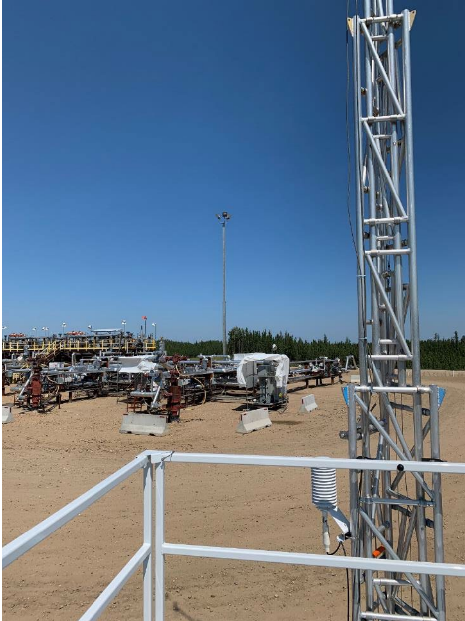
Figure 4 – Environment looking North

The following photos show the environment surrounding the monitoring station.