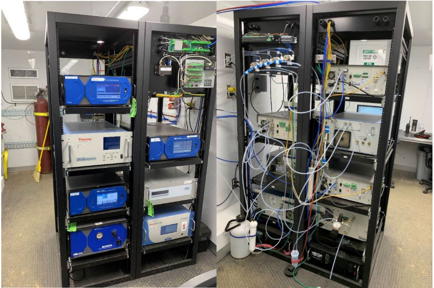
Figure 11 –Photo of the front and the back of instrument rack