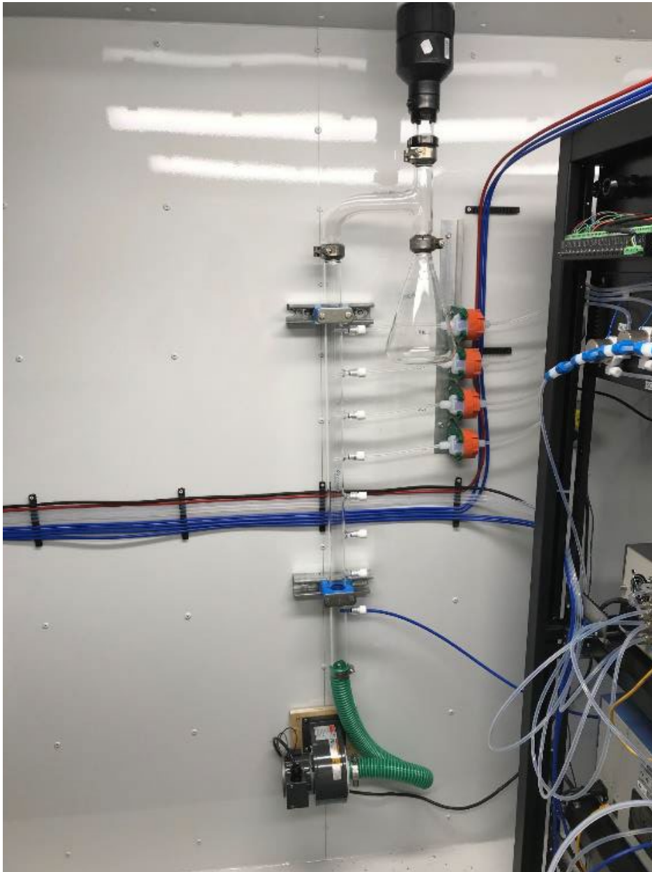
Figure 9 – Photo showing the inlet and sample manifold

The following photos show the monitoring station and instrumentation.