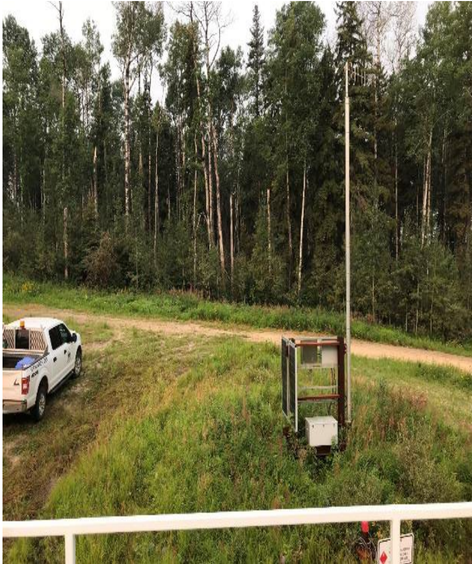
Figure 8 – Environment looking West