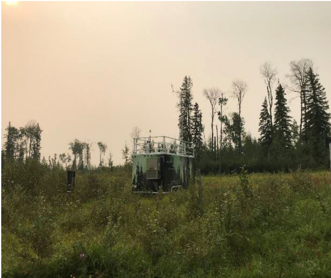
Figure 11 – Curb shot of the monitoring station