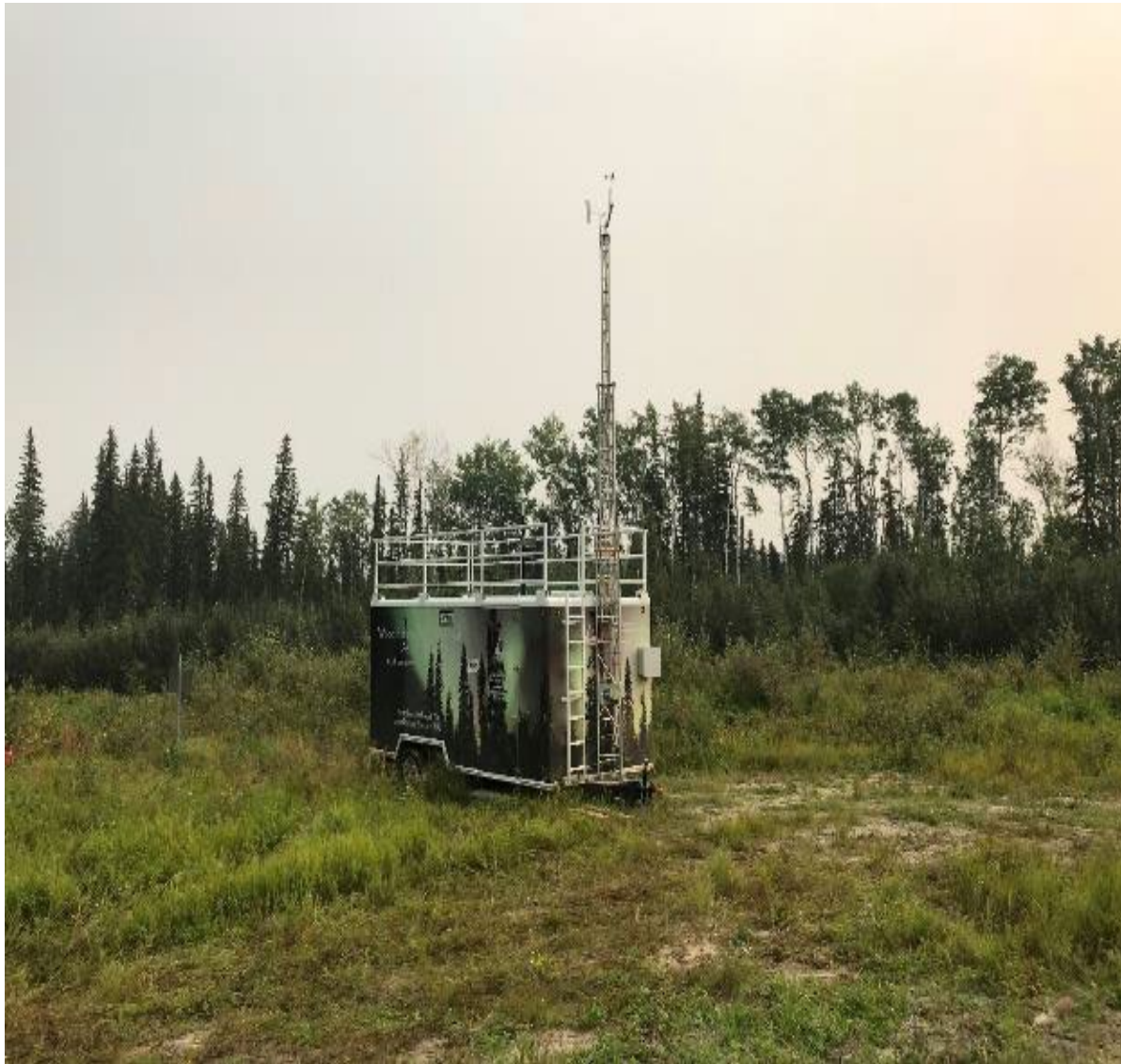
Figure 9 – Meteorological Tower