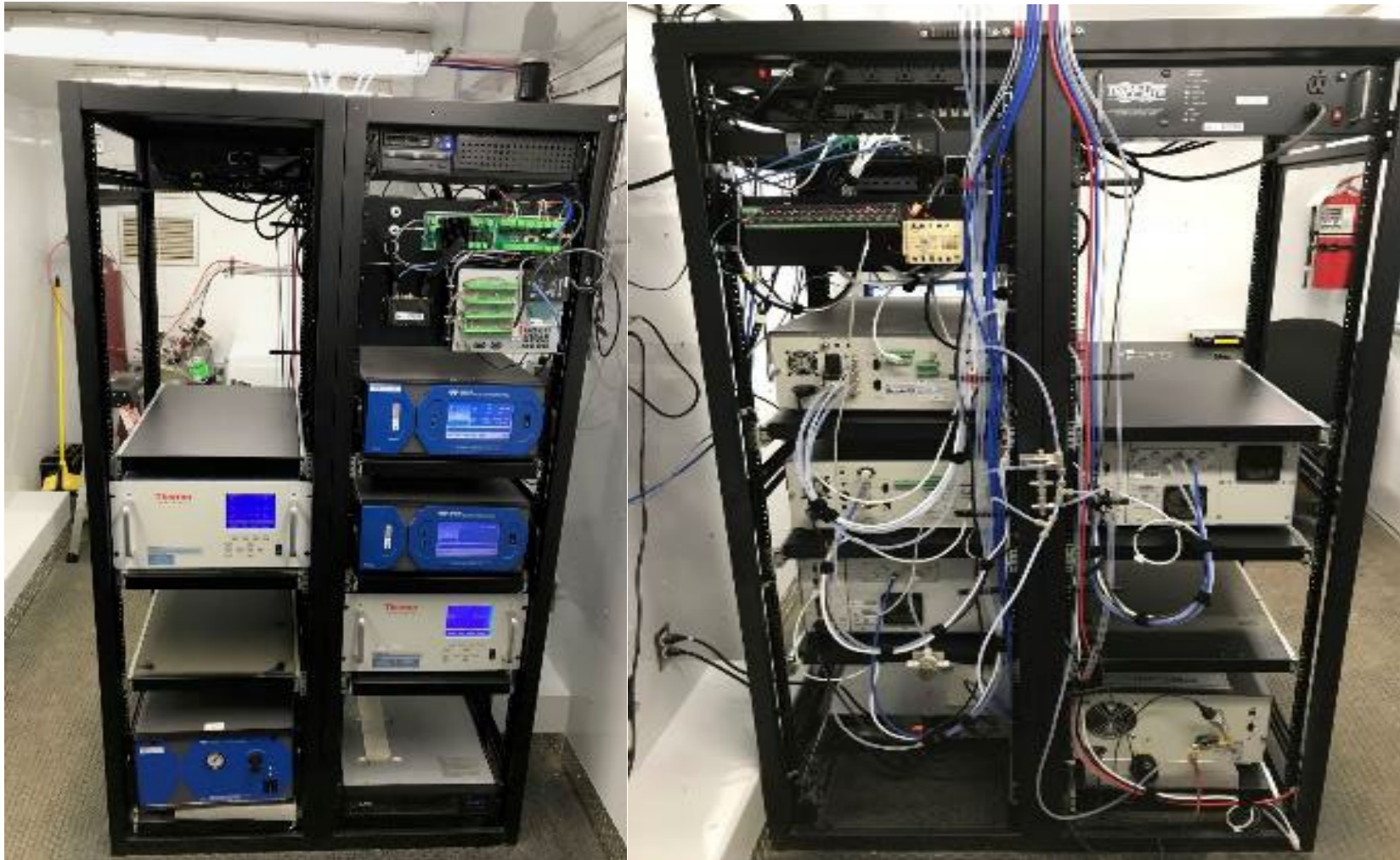
Figure 12 –Photo of the front and the back of instrument rack