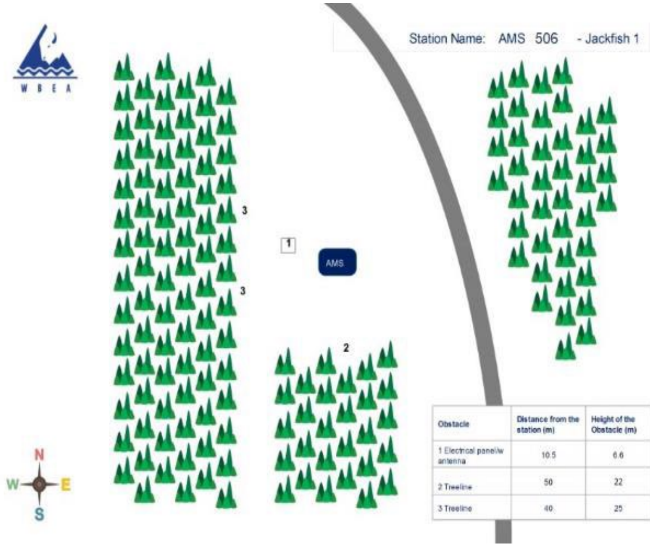
Figure 3 – Plan view image for AMS 506 site