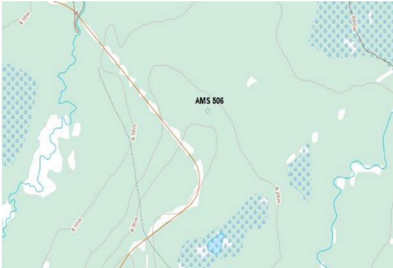
Figure 1 – Area topographic map showing AMS 506