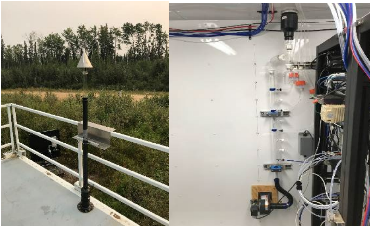
Figure 10 – Photo showing the inlet and sample manifold

The following photos show the monitoring station and instrumentation.