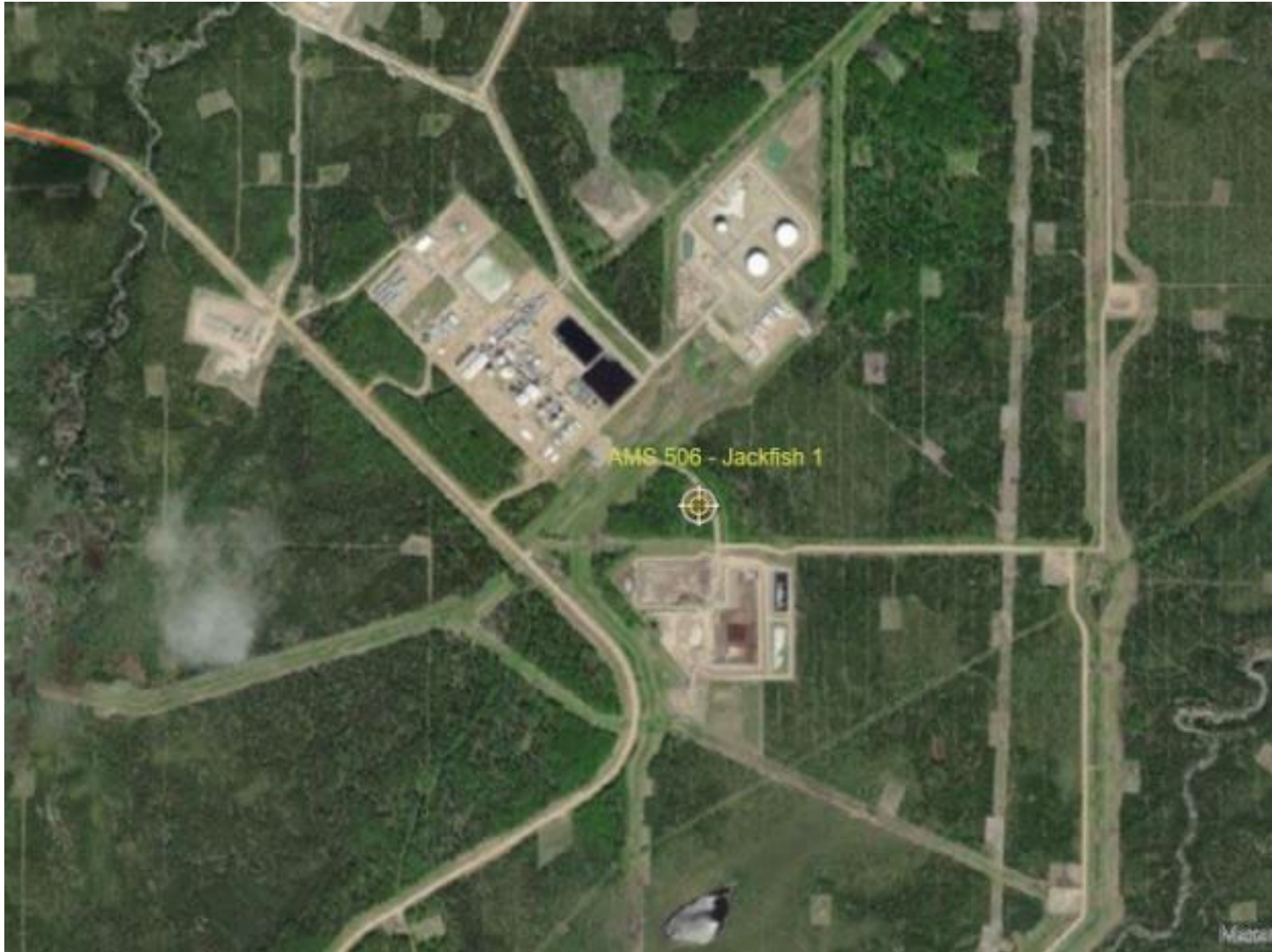
Figure 2 – Aerial image showing AMS 506