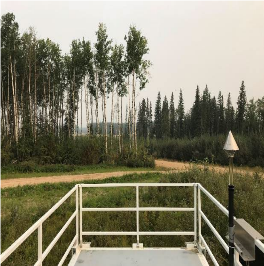
Figure 5 – Environment looking North

The following photos show the environment surrounding the monitoring station.