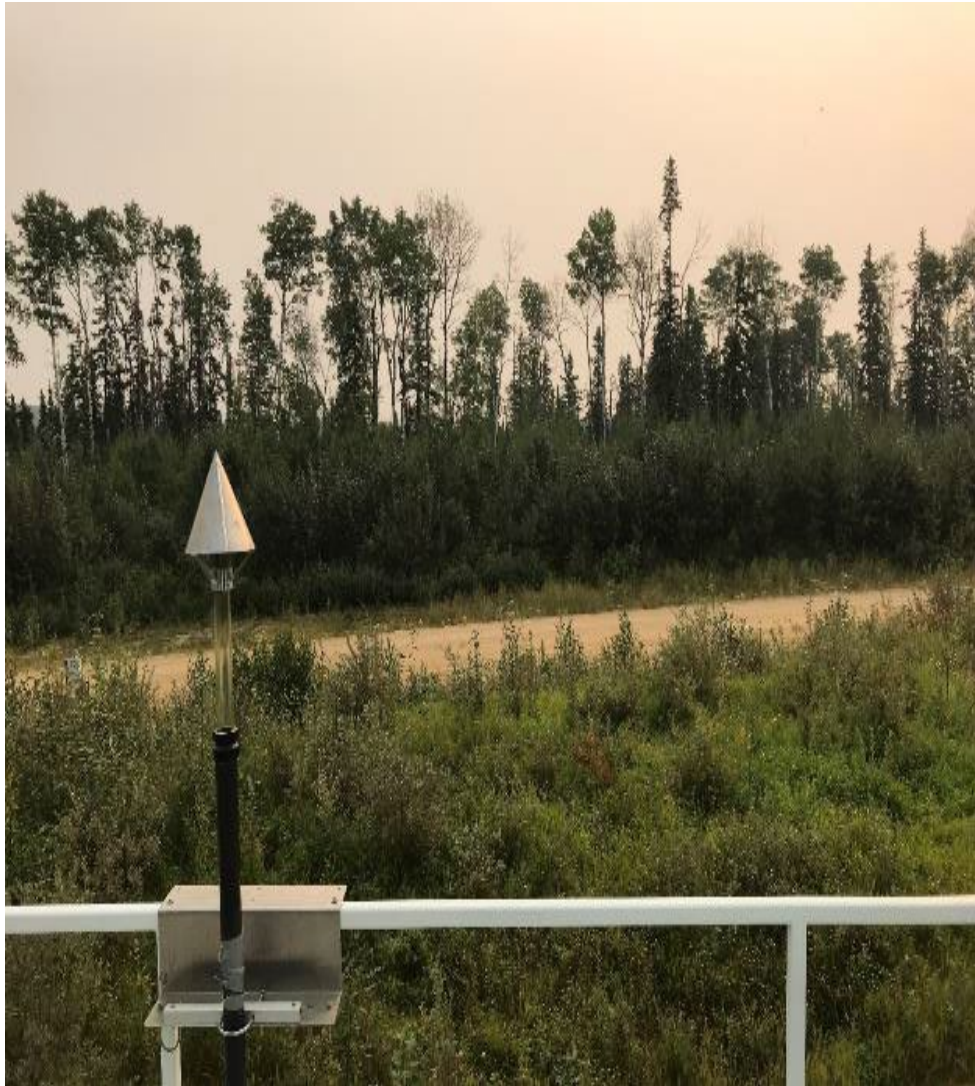
Figure 6 – Environment looking East